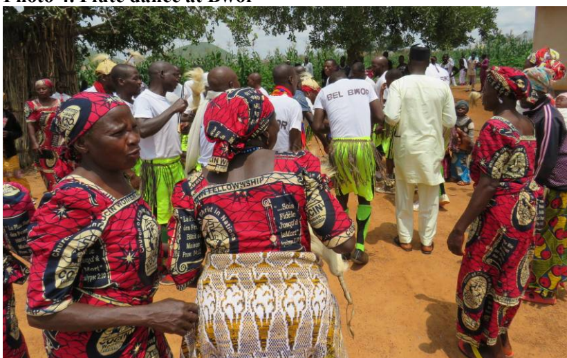
Photo 4. Flute dance at Bwor