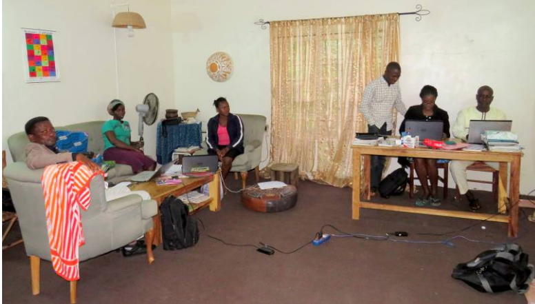
Photo 1. Simultaneous work on Mwaghavul, Tal and Irigwe

d) Intensive work on the Dictionary of Tal. A preliminary Edition has been prepared and funds allocated for printing. Cover shown below