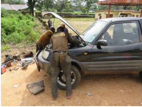
Photo 5. The hazards of fieldwork in Nigeria