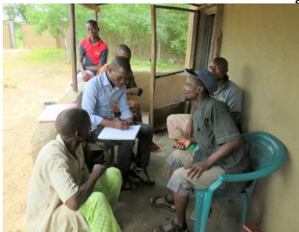
Photo 3. With Gera speakers